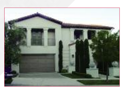
Sun Residence, Newport Coast, CA